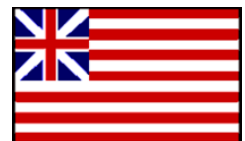
Grand Union Flag - 1776